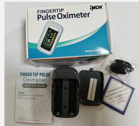
Full set package