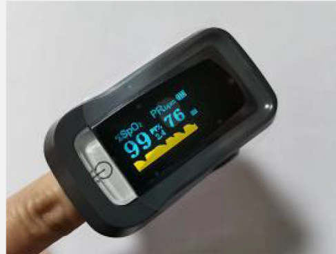
Display: OLED (Hd, blue and yellow two color)