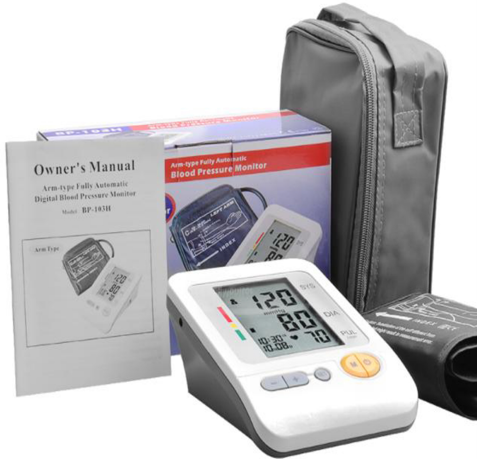
Arm Blood Pressure Monitor