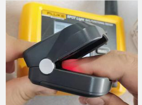
With Silicone pad (More comfortable to use)