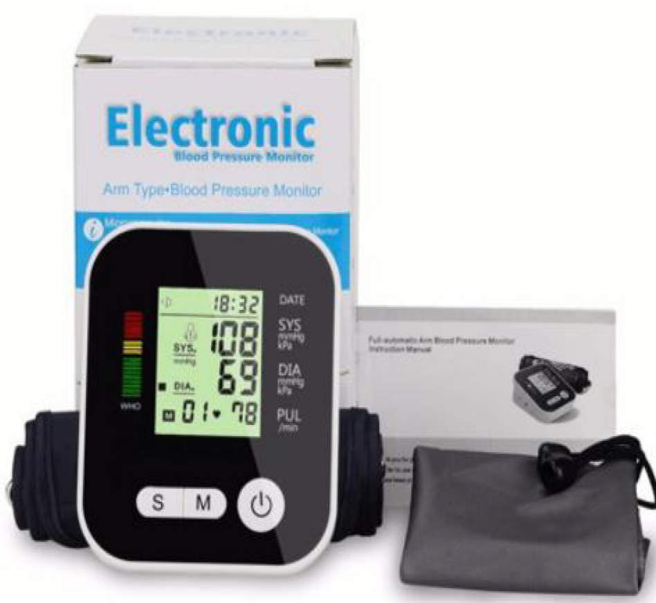
Arm Blood Pressure Monitor