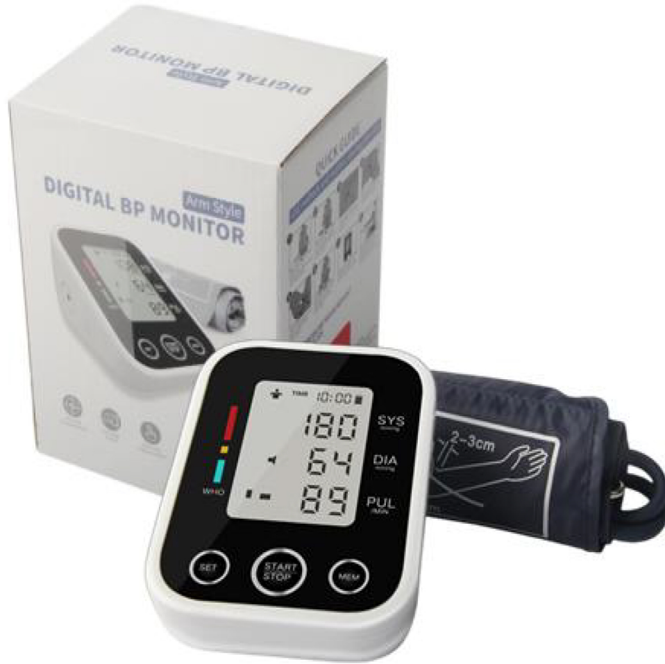
Arm Blood Pressure Monitor