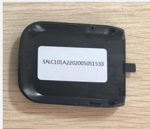
SN number (This data is unique)