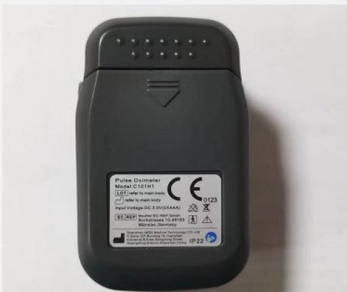
Sticker standard (Information meet standards)