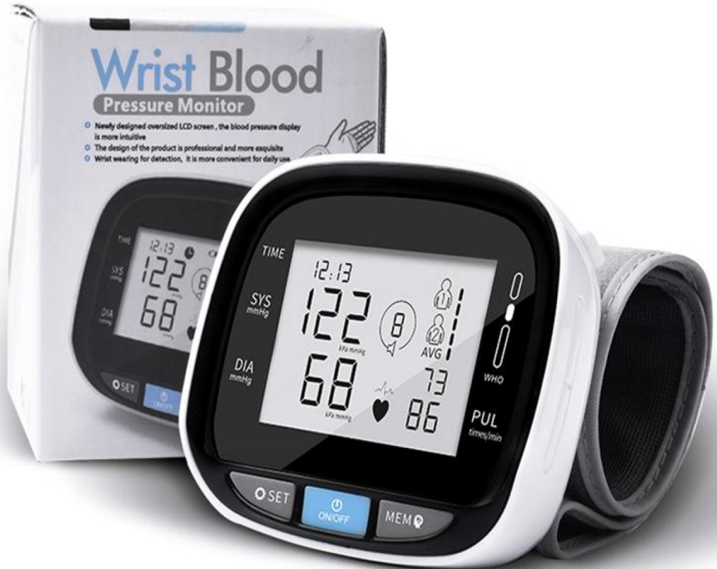
Wrist Blood Pressure Monitor