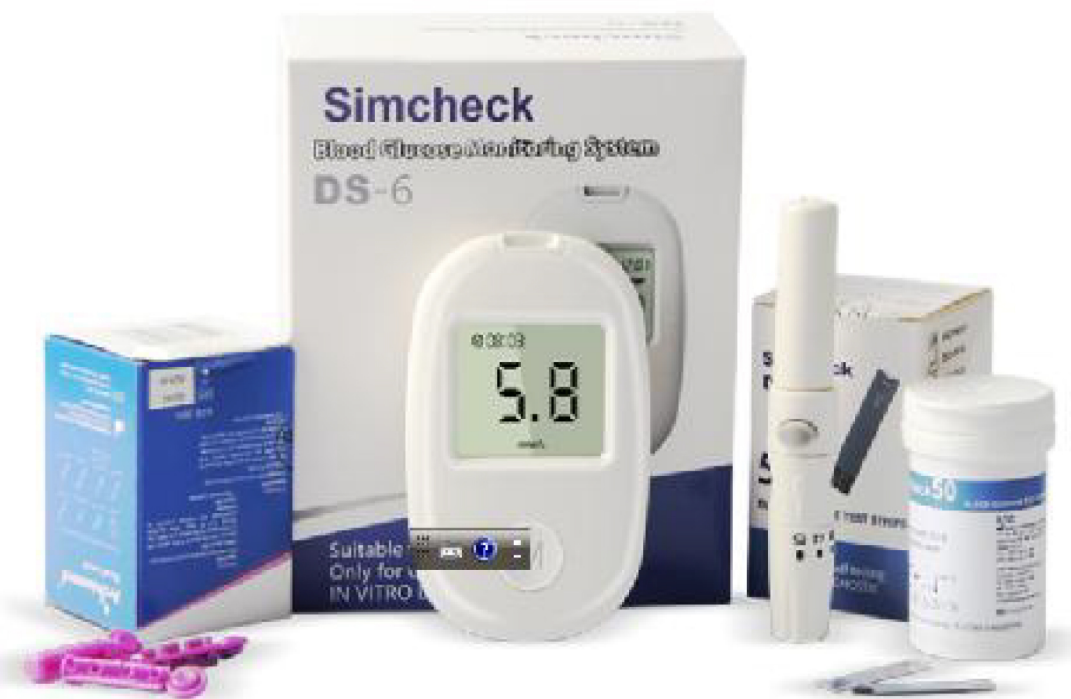
Blood glucose meter