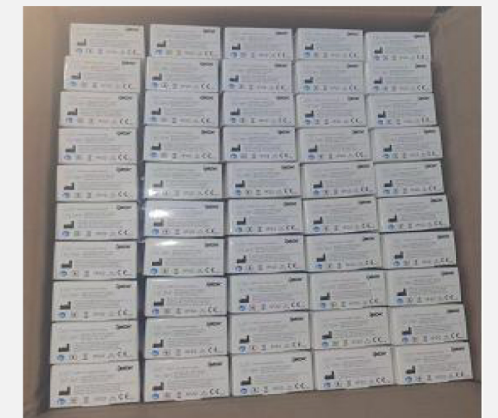
200 pcs a carton