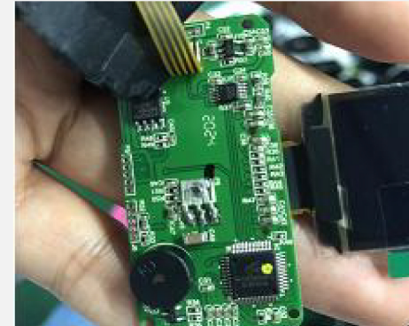
High quality chips (More accurate response data)