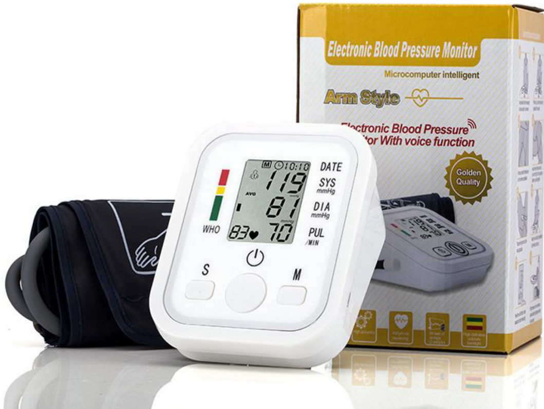
Arm Blood Pressure Monitor