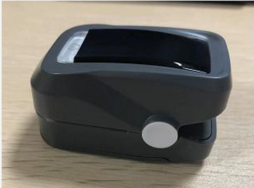
Material: ABS+PC (Environmental friendly level)