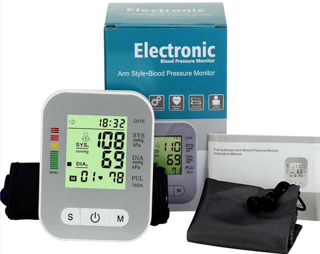
Arm Blood Pressure Monitor